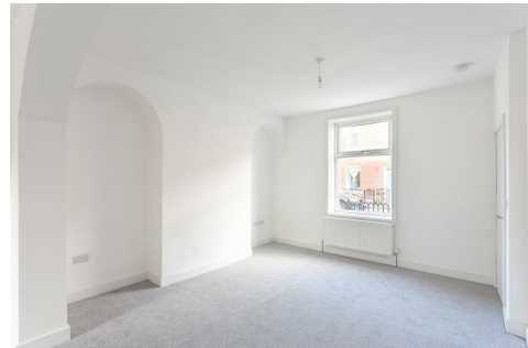
GROUND FLOOR 437 sq.ft. (40.6 sq.m.) approx.

IMPORTANT NOTE: These particulars and the descriptions and measurements herein do not constitute representation and whilst every effort has been made to ensure accuracy, this cannot be guaranteed.